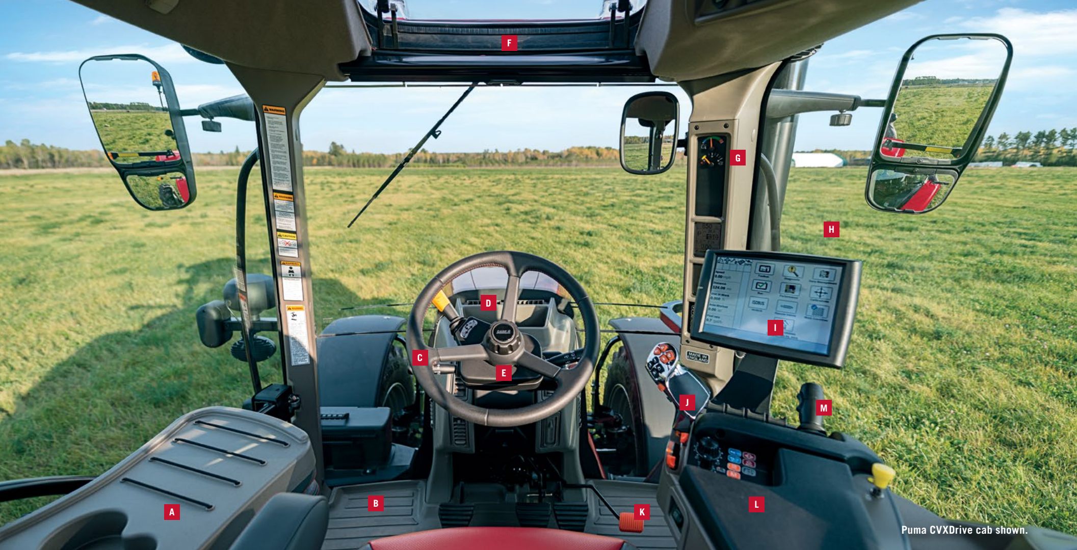
Puma CVXDrive cab shown.