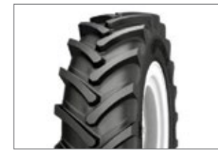
R-1 (ag tread) tire – standard tread