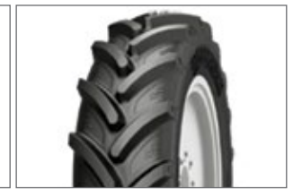
R-1W (ag tread) tire – utility tread, hard or wet surfaces.