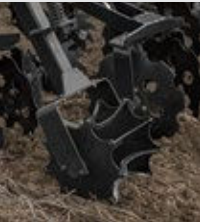
▲ Berm Condition'r

Order your Nutri-Tiller factory-fit and ready-to-connect with the Case IH Precision Air™ 5 series air cart. The combination delivers up to two different dry fertilizers in a consistent band in the root zone.