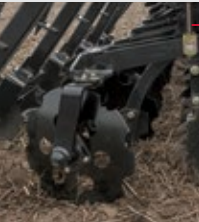
▲ Berm Build'r